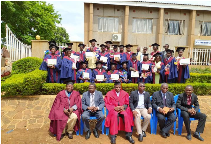
In-depth Course graduating team together invited guests

realized. As we totally attribute this achievement to our Lord Jesus Christ, we are also deeply humbled for the contributions by our partners for being faithful and committed to helping us. These include GZB, CCAP Nkhoma Synod, CCAP Blantyre Synod, all other churches participated, Evangelical Association of Malawi (EAM), facilitators, SIM Malawi leadership, students themselves, Calvary Family church leadership and workers just to mention a few. Despite the COVID -19 pandemic crisis, this year we ready to conduct yet another In-depth Course, now in the Yao (Eastern Region). This is where Muslims are in majority as compared to any religion in Malawi. We expect to conduct at two places at Ntaja (30) and Liwonde (30) because of the rise in numbers to attend. We are praying that God will go through again with us against this Corona Virus so that we can start these important trainings very soon.