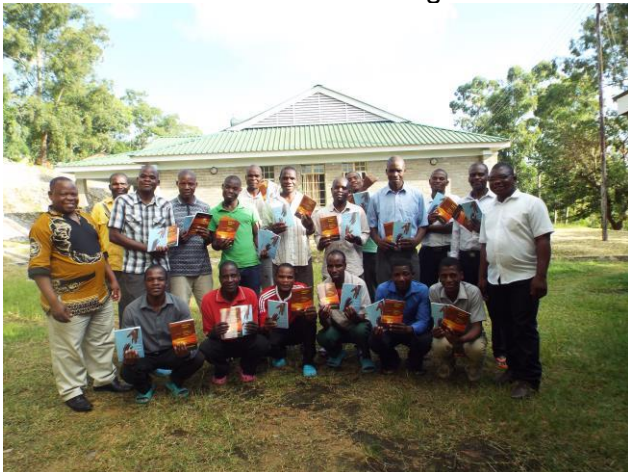
Zambezi Church Planters after Missions class by Mthenga Wabwino