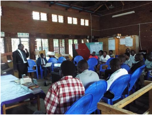
Eastern Region awareness on In-depth Course